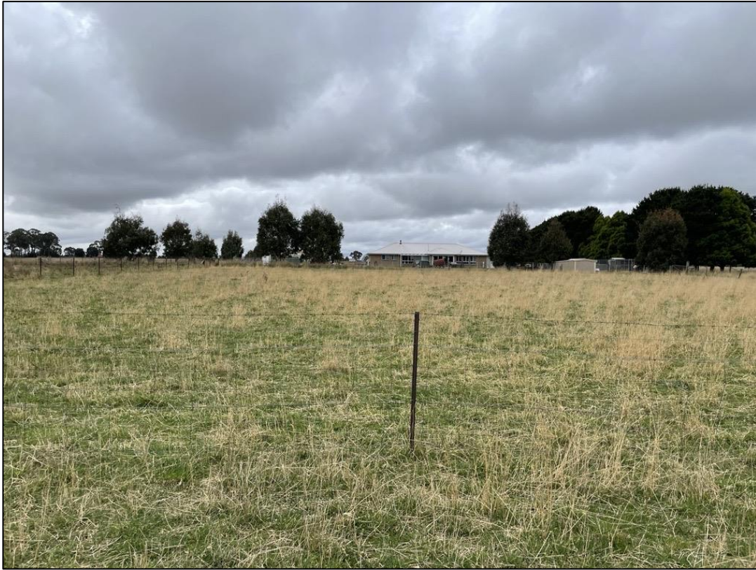
Looking north over the recommended application area